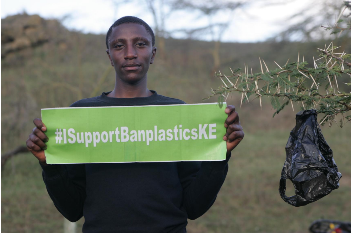
A resident of Nakuru asking the Kenyan government to ban plastic bags