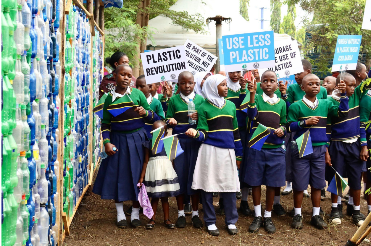
School children in Mwanza hold up signs calling for a plastic revolution