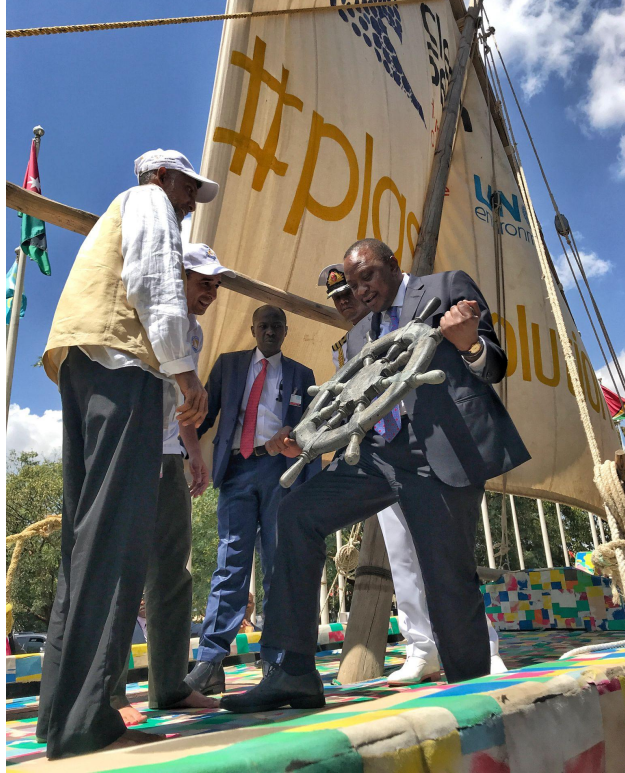
President Uhuru Kenyatta visits the Flipflopi dhow during UNEA 4 in Nairobi